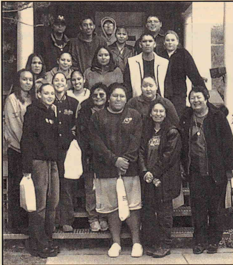
This group of outstanding native high school students from Montana toured the UTTC Campus in mid-October under a program known as Talent Search. The students were from Box Elder, Fort Belknap, Havre, and Rocky Boy. Tours of the campus are open to any group or individual interested in learning about UTTC.