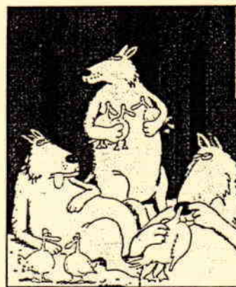
Some wolves. their habitat destroyed and overwhelmed by human pressures. turn to snorting quack.