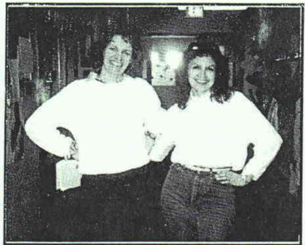
Call and wish these older teachers at TJES a Happy Belated 50th Birthday!!!