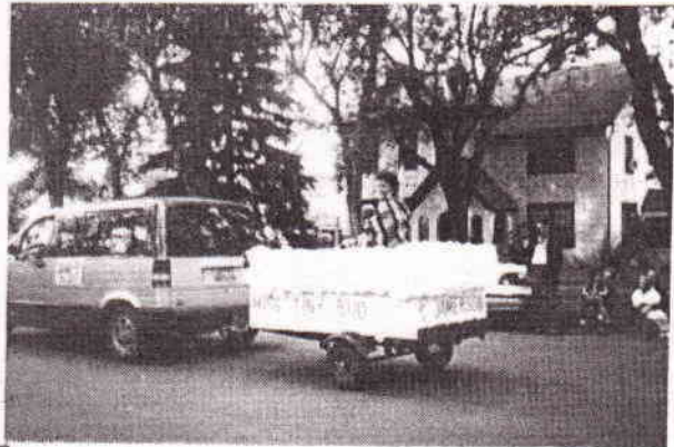
"MISS TINY BUD" PARADE

Theodore Jamerson Elementary School entered two floats in the Miss Indian America Parade. It was widely felt by UTTC staff, adult students, and the students of TJES that the elementary school's involvement in the Pow Wow and Parade was a good idea. . .one worth repeating in the years to come.