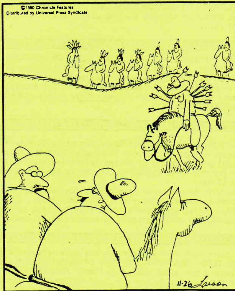
"Now stay calm . . . Let's hear what they said to Bill."

The UNITED TRIBES TECHNICAL COLLEGE NEWSLETTER is an on-campus publication of the United Tribes Technical College, 3315 University Drive, Bismarck, North Dakota 58504. Phone: 701-255-3285, EXT. 227.