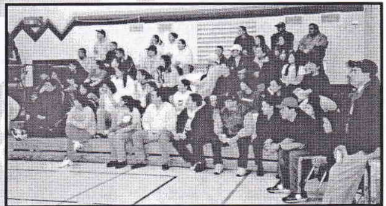
United Tribes T-Birds play basketball while local fans and President Gipp watch enthusiastically.